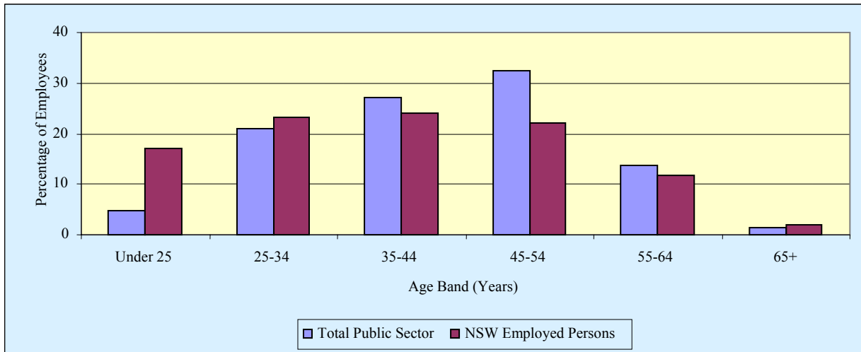
Figure 2: NSW Public Sector Employees and NSW Employed Persons by Age 1