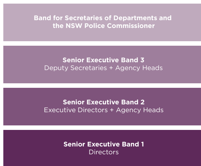
Figure 2: Public Service senior executive bands

The current Chief Executive Service, SES and award-based senior executives (Senior Officers and equivalent roles) will be replaced by a single executive structure with one set of employment arrangements for all. The streamlined structure for Public Service senior executives will comprise a top band for Department Secretaries and three bands for Public Service senior executives as shown.